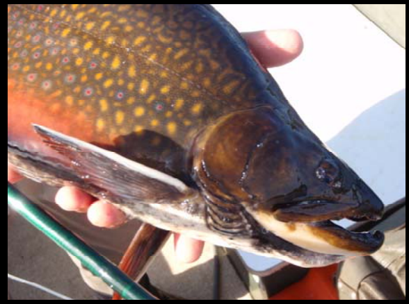
Mac Myers 7lb Brookie