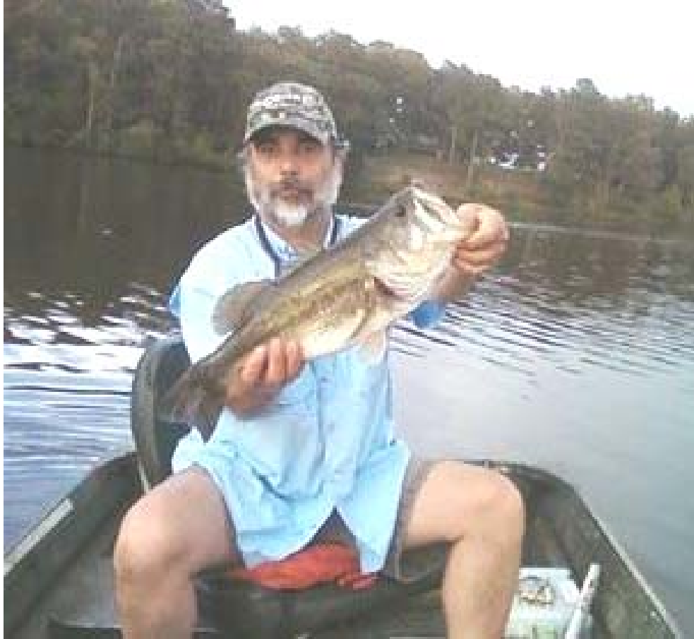
Winn Will Cohoke Pond 22.5in Largemouth 4wt Rod Red Popping Bug