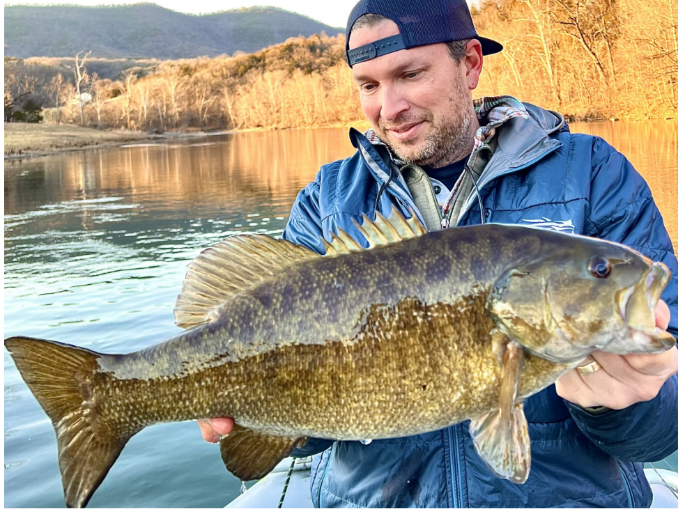
Colby Trow Shenandoah Smallmouth